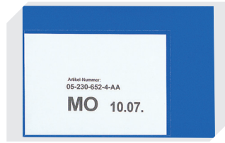
Document pockets self-adhesive 2 sides open L 145 x W 100 mm 46-21108