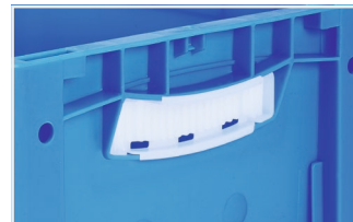
Grip closures suited for bins with a height of 320 and 420 mm 43-31448