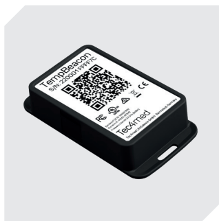
TempBeacon data logger L 88 x W 45 x H 16 mm 77-51235