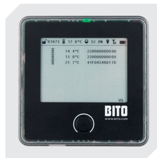
SmartLock Gateway monitoring system L 129 x W 129 x H 35 mm 77-51268