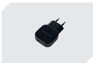
USB Power adapter 12 W 77-51278