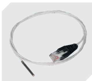
Pt100 4-wire dry ice sensor 77-51272