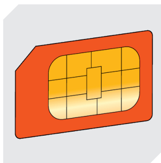
Data tariff worldwide SmartHub/SmartLock 77-51360