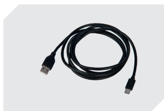
USB Type C charging cable straight version L 1800 mm 77-51277