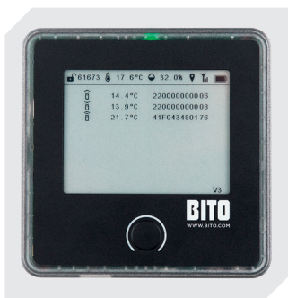
SmartHub Alkaline Gateway monitoring system L 129 x W 129 x H 29 mm 77-51270