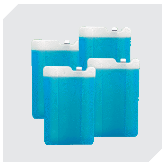
Cold pack PCM 4°C – 700 ml set of 4 pcs L 210 x W 135 x H 30 mm 77-51181