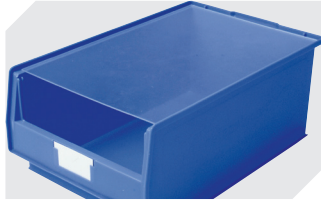
Dust covers for storage bins PK L 300 x W 200 x H 2 mm 2-1135