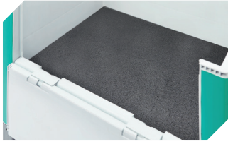
Non-slip grip matting for heavy duty containers SL L 720 x W 520 x H 8 mm 52-30380