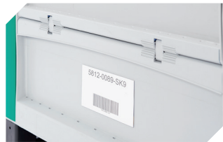
Label holders W 240 x H 80 mm 52-30386