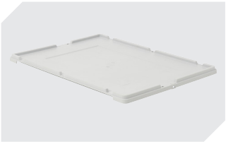
Drop-on lid L 800 x W 600 mm 52-30500