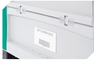
Label holders W 240 x H 80 mm 52-30386