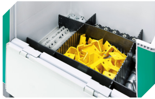
Slot-in divider strips lengthwise L 724 x W 5 x H 180 mm 52-30385