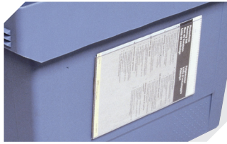
Document pockets self-adhesive 3 sides open L 175 x W 105 mm 6-5031