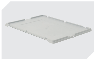
Drop-on lid L 800 x W 600 mm 52-30500