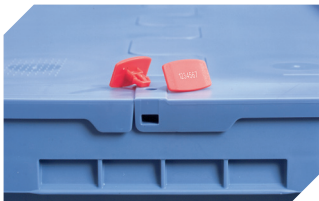
Security seals MBP2-L - suited for BITOBOX MB, XL, SL 6-19162