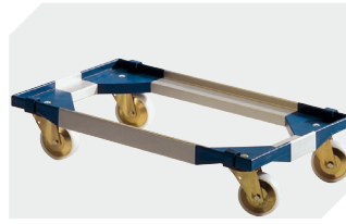
Transport dolly for multi-purpose containers sized 800 x 400 mm and 800 x 600 mm L 720 x W 540 mm 6-19439