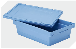
Drop-on lid for multi-purpose containers MB L 400 x W 300 mm 6-11080