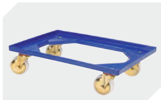
Transport dolly polypropylene wheels L 620 x W 420 mm 43-1491