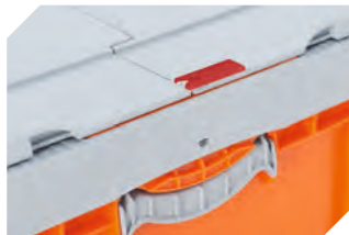
Security seals suited for BITO folding boxes EQ 51-31438