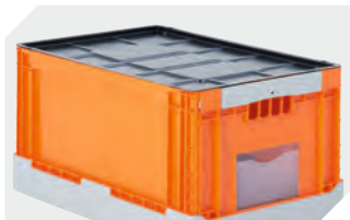
Drop-on lids suited for BITO folding boxes EQ L 592 x W 392 mm 51-31437