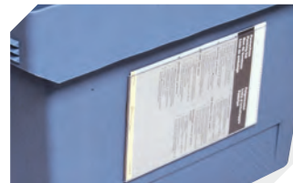
Document pockets self-adhesive 3 sides open L 175 x W 105 mm 6-5031