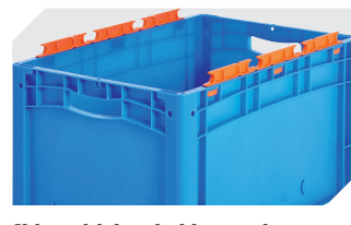
Sides with bag holder notches demountable 6-31553