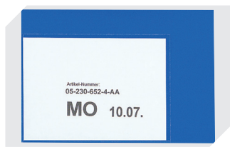
Document pockets self-adhesive 2 sides open L 145 x W 100 mm 46-21108