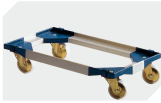
Transport dolly for multi-purpose containers sized 800 x 400 mm and 800 x 600 mm L 720 x W 540 mm 6-19439