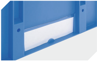
Label covers for multi-purpose containers MB W 60 x H 80.4 mm 6-15244