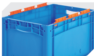
Sides with bag holder notches demountable 6-31553