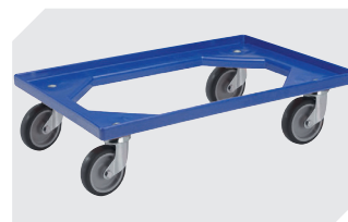
Transport dollies rubber wheels L 620 x W 420 mm 43-21883