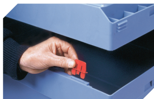
Connector clips 6-15625