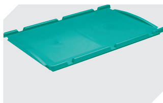
Drop-on lids for small parts containers KLT L 400 x W 300 mm 43-20499