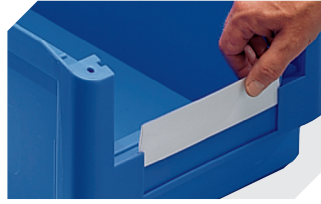
Label covers for storage bins SK L 68.5 x W 12.5 mm 2-19547