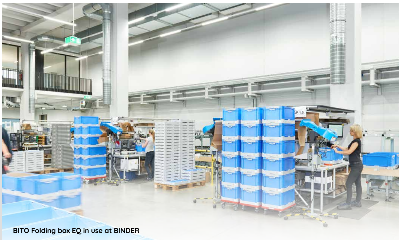
BITO Folding box EQ in use at BINDER

They are space-saving, versatile and can even be used in automated warehouses. Our competent in-house experts will be pleased to provide further information. Contact us today!