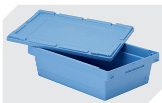
Drop-on lid for multi-purpose containers MB L 400 x W 300 mm 6-30277