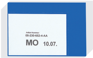
Document pockets self-adhesive 2 sides open L 145 x W 100 mm 46-21108