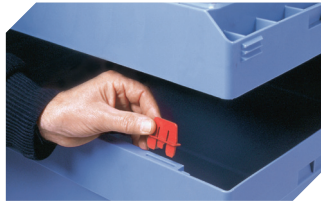
Connector clips 6-15625