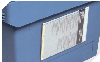
Document pockets self-adhesive 3 sides open L 175 x W 105 mm 6-5031