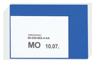
Document pockets self-adhesive 2 sides open L 145 x W 100 mm 46-21108