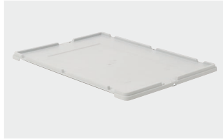
Drop-on lid for European size stacking containers XL L 800 x W 600 mm 43-14853