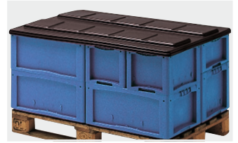
Covers for palletised containers L 1220 x W 820 mm 9-18421