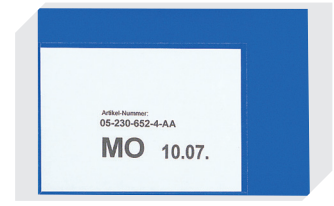
Document pockets self-adhesive 2 sides open L 145 x W 100 mm 46-21108