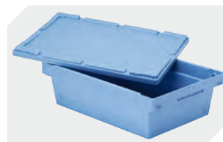
Drop-on lid for multi-purpose containers MB L 800 x W 600 mm 6-22546