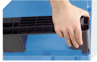
Add-on fork entry shoes for European size stacking containers XL 43-20273