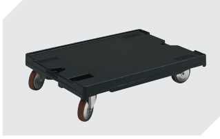
Transport dollies for containers sized 800 x 600 mm L 800 x W 600 x H 198 mm 43-1150