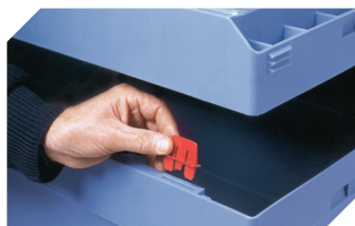
Connector clips 6-15625