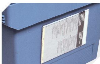
Document pockets self-adhesive 3 sides open L 175 x W 105 mm 6-5031