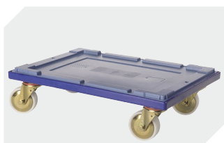
Transport dolly for multi-purpose containers sized 600 x 400 mm L 620 x W 420 mm 6-15510