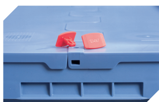
Security seals MBP2-L - suited for BITOBOX MB, XL, SL 6-19162