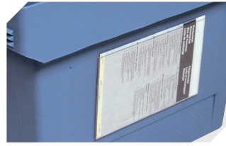
Document pockets self-adhesive 3 sides open L 175 x W 105 mm 6-5031