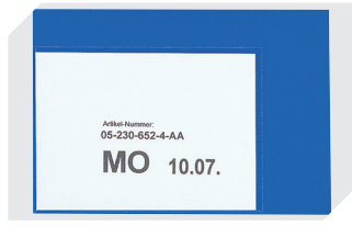
Document pockets self-adhesive 2 sides open L 145 x W 100 mm 46-21108