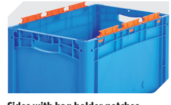
Sides with bag holder notches demountable 6-31553