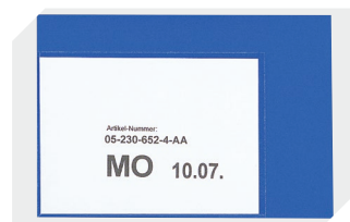
Document pockets self-adhesive 2 sides open L 145 x W 100 mm 46-21108