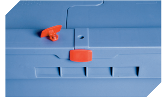
Security seals MBP2 - suited for BITOBOX MB 6-15705