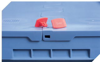
Security seals MBP2-L - suited for BITOBOX MB, XL, SL 6-19162