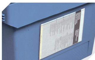
Document pockets self-adhesive 3 sides open L 175 x W 105 mm 6-5031