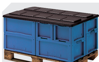
Covers for palletised loads L 1220 x W 820 mm 9-18421