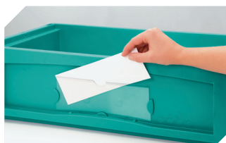
Label covers for small parts containers KLT for European size stacking containers XL firm fit W 218 x H 80 mm 9-20054