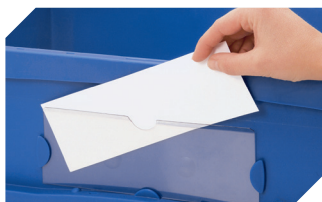
Labels suited for BITOBOX XL and KLT with a height of at least 170 mm W 210 x H 74 mm 43-14557