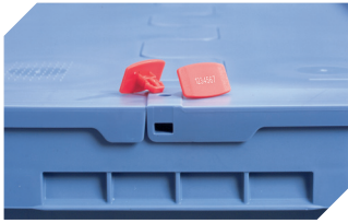
Security seals MBP2-L - suited for BITOBOX MB, XL, SL 6-19162