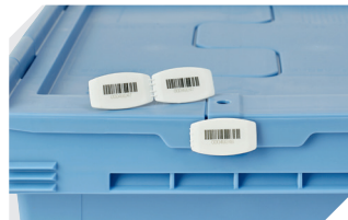
Barcoded security seals MBP3 - suited for BITOBOX MBs in all sizes and XLs 800 x 600 mm 6-31550