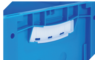
Grip closures for European size stacking containers XL with a height of 170, 220 and 270 mm 43-31450