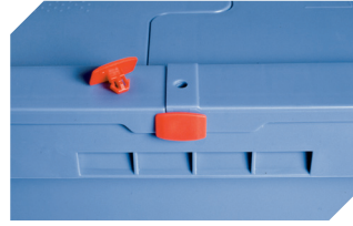
Security seals MBP2 - suited for BITOBOX MB 6-15705