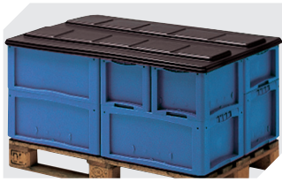
Covers for palletised loads