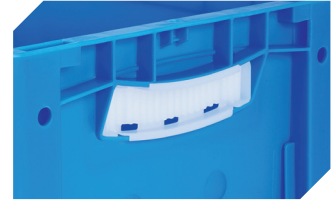
Grip closures for European size stacking containers XL with a height of 170, 220 and 270 mm 43-31450