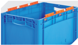
Long sides with notches for fixing bag handles demountable 6-31553