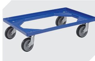
Transport dolly rubber wheels L 620 x W 420 mm 43-21883