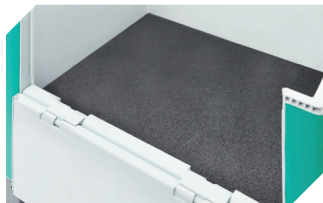
Non-slip grip matting for heavy duty containers SL L 720 x W 520 x H 8 mm 52-30380