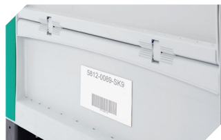
Label holders W 240 x H 80 mm 52-30386