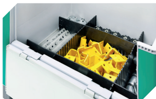
Slot-in divider strips lengthwise L 724 x W 5 x H 180 mm 52-30385