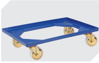
Transport dollies polypropylene wheels L 620 x W 420 mm 43-1491