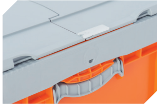
Security seals with laser marking suited for BITO folding boxes EQ 51-31666