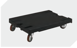
Transport dolly for containers sized 800 x 600 mm L 800 x W 600 mm 43-1150