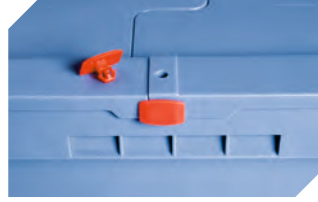
Security seals MBP2 - suited for BITOBOX MB 6-15705