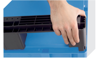
Add-on fork entry shoes for European size stacking containers XL 43-20273