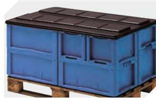
Covers for palletised containers L 1220 x W 820 mm 9-18421