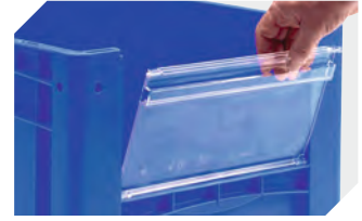
Windows for European size stacking containers XL W 460 x H 198 mm 43-22548