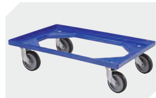
Transport dolly rubber wheels L 620 x W 420 mm 43-21883