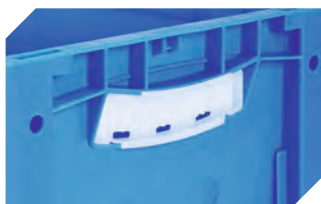
Grip closures suited for bins with a height of 320 and 420 mm 43-31448