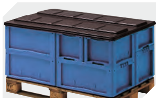
Covers for palletised containers L 1220 x W 820 mm 9-18421