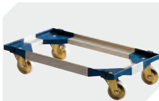
Transport dolly for multi-purpose containers sized 800 x 400 mm and 800 x 600 mm L 720 x W 540 mm 6-19439