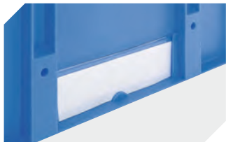
Label covers for multi-purpose containers MB W 60 x H 80.4 mm 6-15244