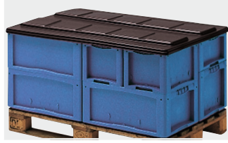
Covers for palletised containers L 1220 x W 820 mm 9-18421