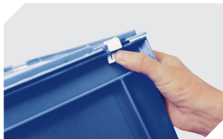
Hinge clips for lids for European size stacking containers BN 4-1144