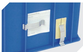
Document clips for European size stacking containers L 80 x W 18 mm 4-1492