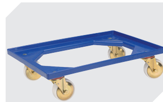
Transport dollies polypropylene wheels L 620 x W 420 mm 43-1491