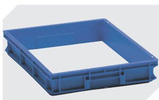
Collars L 600 x W 400 x H 78 mm 4-1568