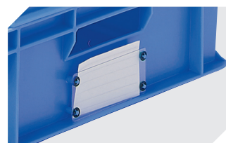
Label covers for European size stacking containers BN can be retro-fitted W 110 x H 46 mm 4-9454