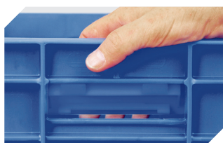
Grip closures for European size stacking containers BN 4-18671