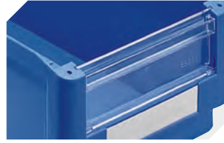
Windows for storage bins SK 2-1112