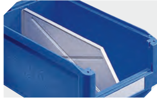
Longitudinal dividers for storage bins SK 2-1075