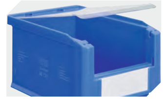
Dust covers for storage bins SK L 482 x W 299 x H 2.5 mm 2-1136