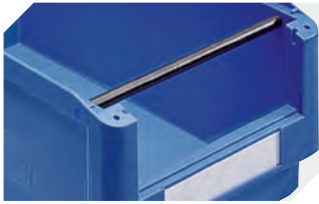
Handles for storage bins SK L 281 mm 2-19527