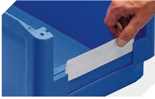
Label covers for storage bins SK L 178 x W 42 mm 2-1066