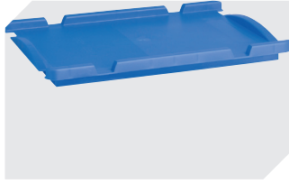
Drop-on lids for European size stacking containers XL L 300 x W 200 mm 43-30392