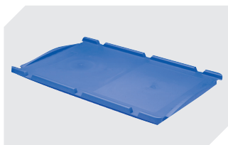
Drop-on lids for European size stacking containers XL L 200 x W 150 mm 43-30209