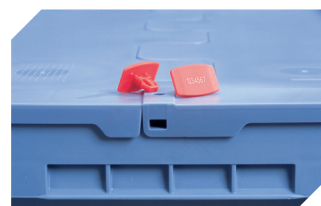
Security seals MBP2-L - suited for BITOBOX MB, XL, SL 6-19162