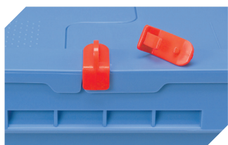
Locking clips suited for BITOBOX MB 6-20299